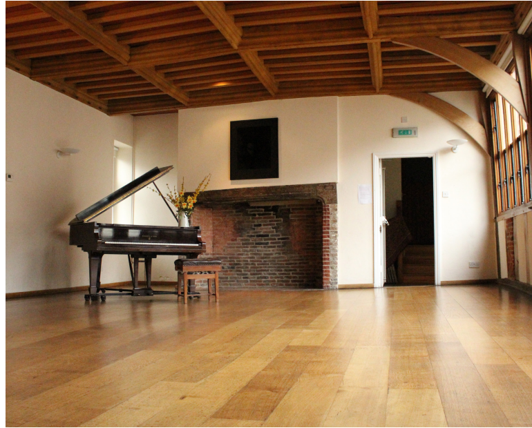
The Music Room

NEW from Autumn 2021, we can now host your ceremony in our beautiful, tranquil outdoor courtyard where you will be surrounded by the architecture of our historic Tudor building. The capacity for this area is 60 people. We can offer wet weather alternatives when booking the Courtyard, which would be the Music Room or Main Gallery.