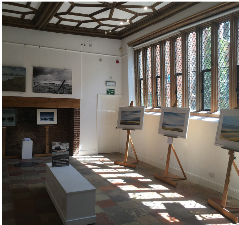
The Main Gallery